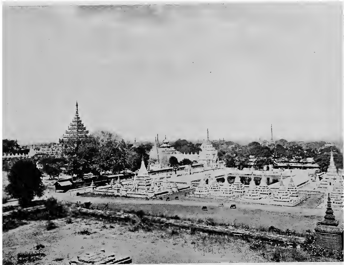
The Arracan Pagoda, Mandalay